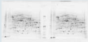
2D HPE™ Double Gel NF 12.5 %, stained with SERVA Purple