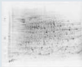
2D HPE™ Large Gel NF 12.5 %, stained with SERVA Purple